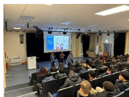
St Bedes 6th form