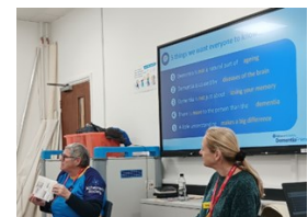
Montpelier High Post 16